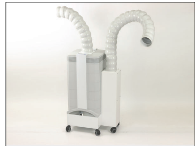
IQAir high-efficiency air purifier with FlexVac mobile source-capture kit.

In January and February 2020 IQAir arranged a number of emergency air freight shipments to Hong Kong including IQAir high-efficiency air purifiers with special FlexVac source-capture kit and OutFlow FlexAir exhaust attachments (photo). Several hundred of these specialised units with suction and exhaust ducts have been in use in over 150 Hong Kong hospitals and clinics ever since the SARS coronavirus outbreak in 2003. Hospitalised patients with COVID-19 symptoms are instructed to cough and sneeze into the flexible suction duct opening which is positioned next to the patient's head. The air containing the infectious droplet nuclei is then sucked into the system and filtered with high efficiency. Virtually microorganism-free air is expelled through the exhaust duct. The flexible duct at the top of the air purifier can be directed away from the patient, to avoid air turbulences near the patient.